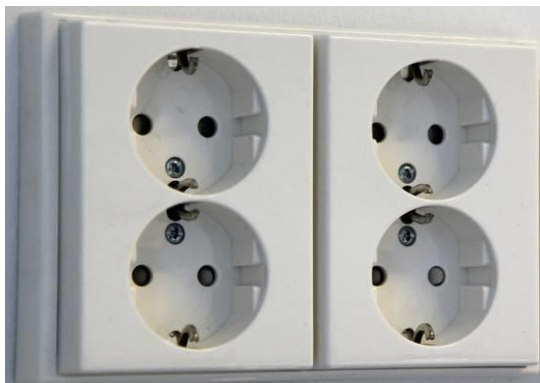
Finnish two-pin Schuko power socket