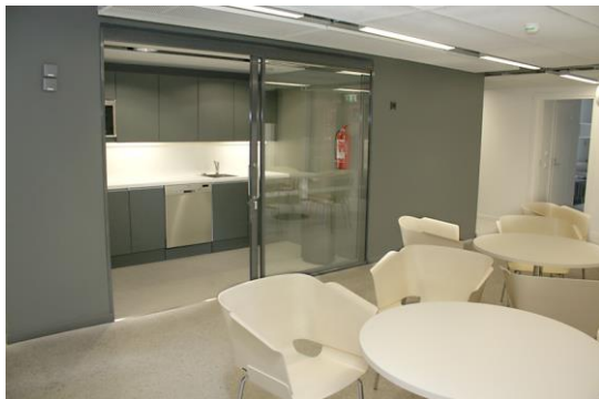
Kitchen and lounge