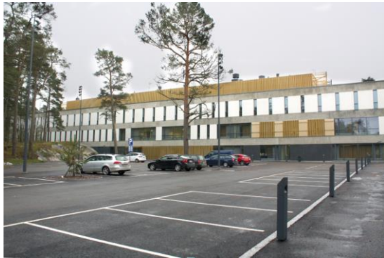
FINCENT is located in Santahamina Building