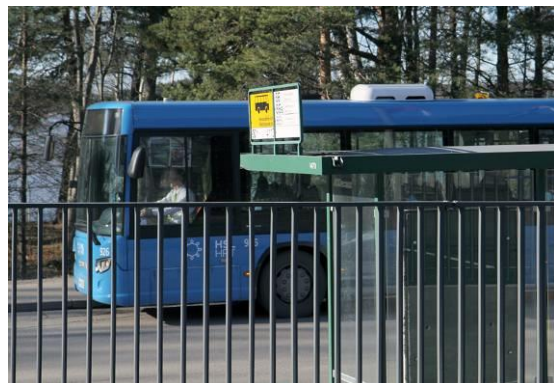
The garrison is served by bus 86