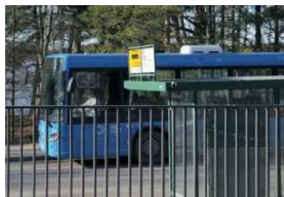
The garrison is served by bus 86