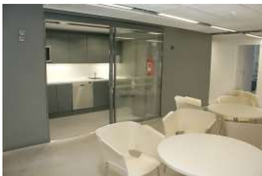
Kitchen and lounge