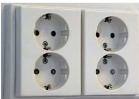
Finnish two-pin Schuko power socket