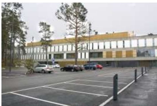
FINCENT is located in Santahamina Building