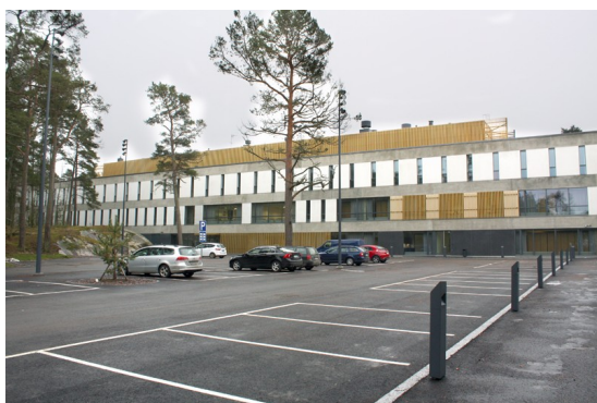
FINCENT is located in Santahamina Building