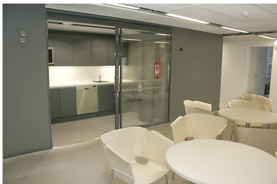
Kitchen and lounge