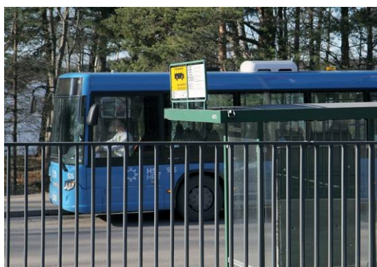
The garrison is served by bus 86